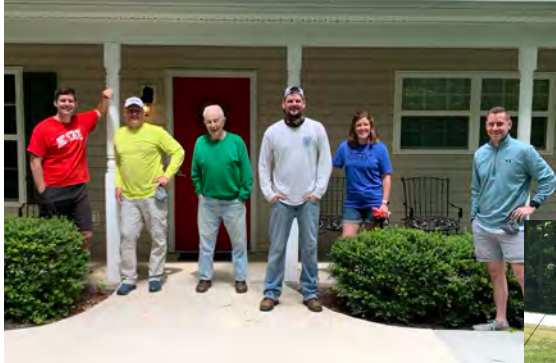
Volunteers at the Tate home work day in Ashland