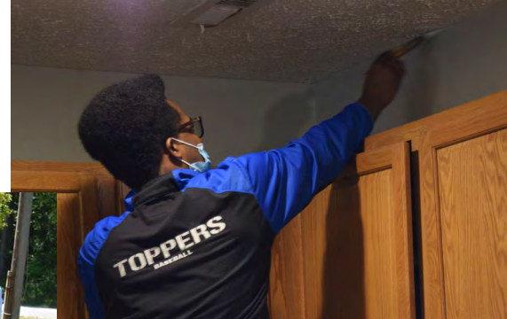
A volunteer painting the kitchen at the Lynchburg home