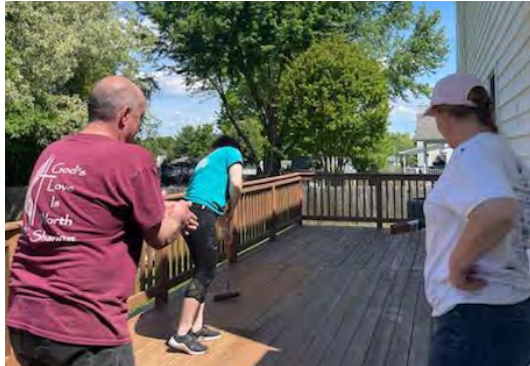
Volunteers staining the back deck at the Bonnie house in Stuarts Draft