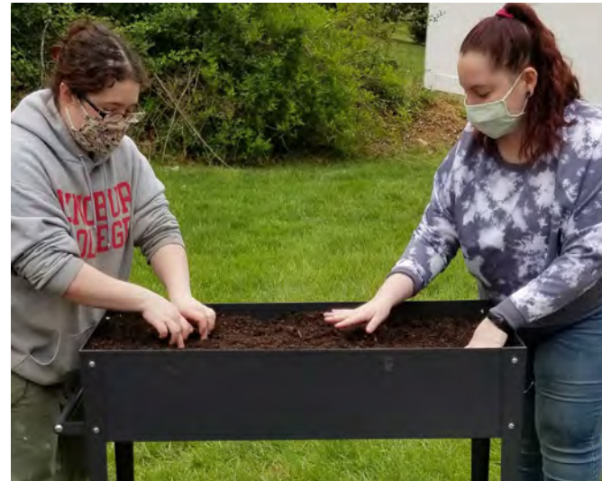
Volunteers at the Lynchburg home preparing a raised garden bed

Heart Havens had a spring and fall work day for each home for upkeep like painting, yard work, and power washing. Volunteers also hosted gift card drives, and collected paper goods for their local homes. They invited residents to cookouts and came by for game nights. Heart Havens is so thankful for our volunteers!